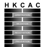
Hong Kong Construction Arbitration Commission 香港建築業仲裁中心(建仲) Hong Kong Construction Mediation Centre 香港建築業調解中心(建調)